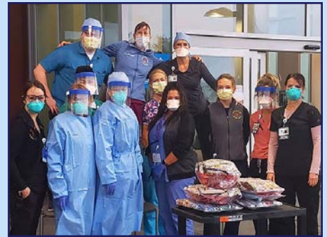
Here’s just a part of the ED team at Sutter that’s benefitting from the Lunches for Lifesavers program.