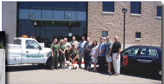
GRU with Code 3 Loans volunteers