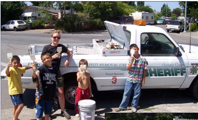
Graffiti Removal Unit at work