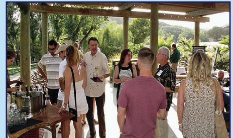
It was a beautiful evening and a gorgeous setting. The outdoor pavilion had sweeping views of Sonoma County savannah and was close to trees and a pond full of flamingos.