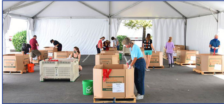
Recent activity at a Redwood Empire Food Bank facility.

Read the entire story on the Press Democrat website at https://www.pressdemocrat.com/article/news/sonoma-county-elected-officials-roll-up-their-sleeves-to-help-redwood-empire/?artslide=1Earlier&fbclid=IwAR3ev-XIK98m66o0fRD7fD2dH_nwsEZFtB_o6sE4y_ntJjrvI9JQUJtc