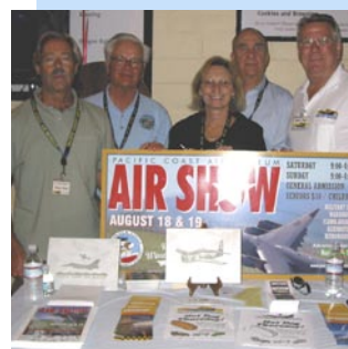
Members of the Pacific Coast Air Museum

SANTA FLY-IN Santa arrives on Saturday, December 15th at 11am at PCAM. All kids are welcome and you don't have to be a member to visit.