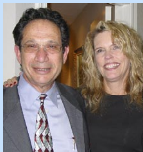
November Social Hosts: Beck Law Offices

In addition to aircraft, the museum continues to acquire donations of continued on page 6