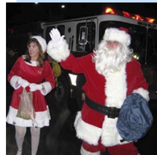
SANTA arrives at the HOLIDAY TREE LIGHTING!

SOCIAL & RIBBON CUTTING! December 13: Mark your calendars for our Holiday Social and Ribbon Cutting for our new Headquarters. This landmark evening will offer smorgasboard of delicious foods & beverages provided by our members.