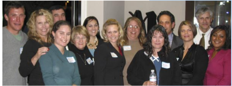
The Beck Law Staff

Beck Law Offices offers a variety of services, including business and family law, criminal and personal injury litigation.