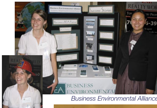
Business Environmental Alliance