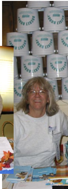
Cal-American Water Company