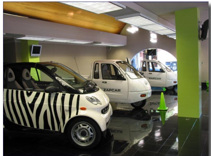
ZAP! Xebra and Xebra PK