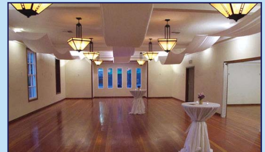
The Mark West Lodge has two large room that can be configured as meeting rooms, ballrooms, dining rooms... whatever you need.