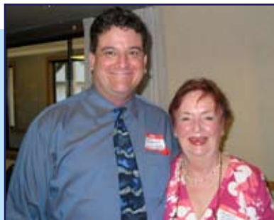
April Social hosted by Healthy Are We & Holiday Inn Express page 3

So next time you attend one of our after-hours socials be sure to purchase some tickets for the 50/50 raffle. The money goes to support some truly great causes. And who knows...you might be rewarded by having the winning ticket!