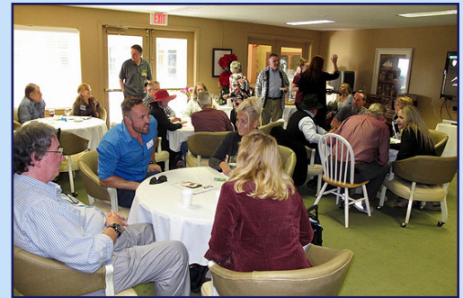
Vineyard Commons is full of wide, bright spaces and comfortable spots for relaxation. We met in a room that opened onto a patio and lawn, and with the doors open it was almost like sitting outside. Very pleasant.