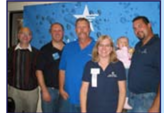
Tradeshow Sponsor: Cal-Am Water Company