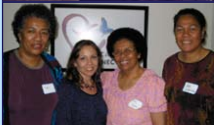
Social hosted by Cal Am Water Co. & GUARDIAN Caregiver Connections page 3