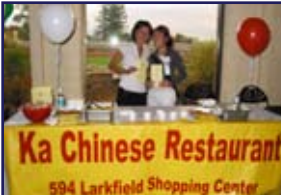
Ka Chinese Restaurant

Thank you to our 20th Annual Harvest Faire & Business Showcase Vendors & Participants!