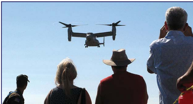
Over 15,000 visitors attended the 2014 Wings Over Wine Country Air Show. Here, they marvel at the capabilities of the USMC MV-22 Osprey tilt-rotor aircraft. Many other aerobatic performers and flight demonstrations by historic civilian and military aircraft kept fans enthralled, and dozens of static display aircraft provided fun and education for young and old.

Next year's air show will be held September 26 & 27, 2015.