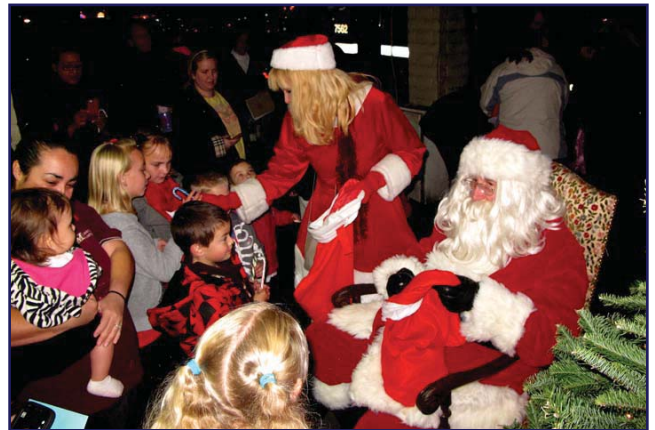
The Mark West Area Chamber of Commerce annual Holiday Tree Lighting will take place Wednesday December 3, 2014 at 6:00 pm, at Mollsberry's Market. Santa will be there too, as he was last year (photo above proves it!) Don't miss it!