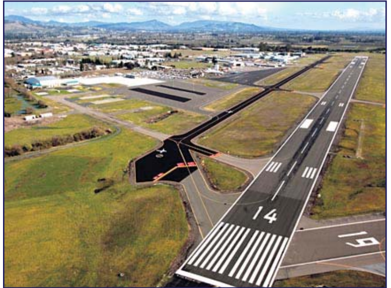
Aerial view of Charles M. Schulz-Sonoma County Airport

The project will also improve safety by separating two runways that currently end at the same location. Creating two separate endpoints for the runways will help eliminate pilot confusion.