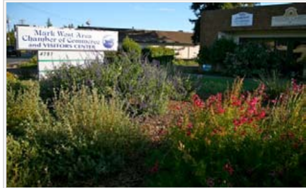
NATIVE PLANTS — The new garden in front of the Mark West Chamber of Commerce is designed to inspire residents looking to reduce their water consumption.